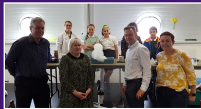
Visit sponsored by Agility

We thank you all for your support for Catalyst and for the pupils in your communities.