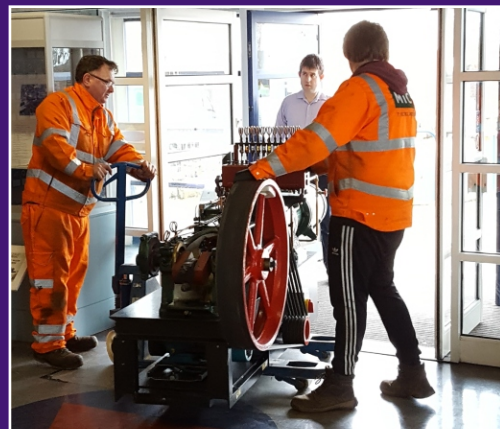
Removal of the Pearn Pump

In January we will begin a six week programme of change as we transform the Reception, Shop, Cafe (with an under 5s area) and Foyer, then between February and the Summer we will completely refurbish our ground floor gallery with 25 stunning new interactive exhibits.