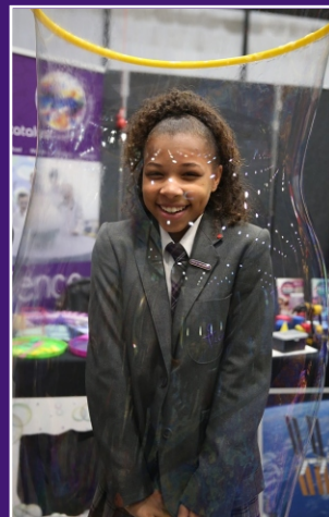
At the Big Bang Liverpool