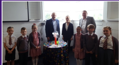
Visit sponsored by Emerald Kalama