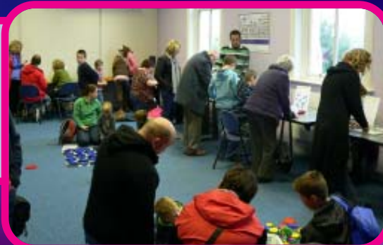
Families enjoying the Puzzle Room during half term

Following the refurbishment of the conference suite it was decided to open it up to the general public as the Puzzle Room during October half term. This was an outstanding success, adding to the Catalyst offer, so much so that it's now a regular feature!