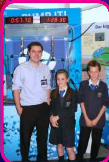
Below: Pupils learn how to assemble the United Utilities pipe rig