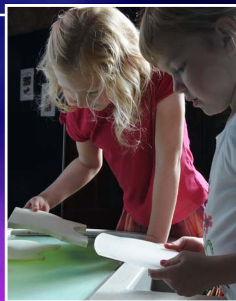
Here's what some of our partners say about working with Catalyst